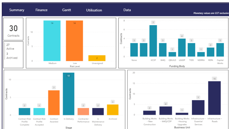
Fig 3.1 Contract Analytics Summary Data

Council now has a 360-degree line of sight of all revenue received, delivery costs and management of risks in the delivery of Grants, Projects and Contracts.